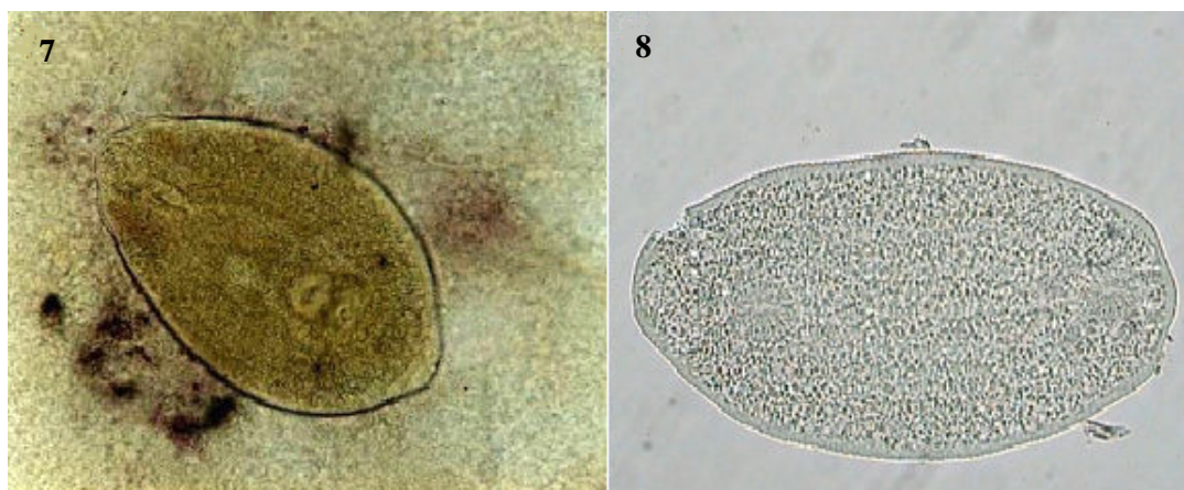
Figure 7: Metacercaria of Diplostomum spathaceum (194 X)