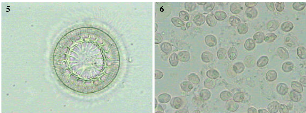
Figure 5: Trichodina sp. (X 186)