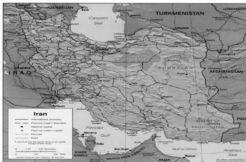
Figure 1: Coastline length at the north and south of Iran

best ideas for fisheries issues. Conventional research methodologies are often costly, take a longer time to accomplish and require the services of experts. Hence, practitioners are continuously developing applied research methodologies that: (1) are cost-effective; (2) can quickly generate information; (3) maximize the participation of concerned stakeholders; and (4) produce relevant results to managers and politicians (Garces et al., 2010). Hence, we use a different methodology to be more effective and reliable. In order to do this, two different methods of SWOT and VE were used in this work. Field study, implementation and analysis of different phases were also discussed.