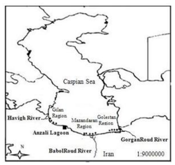
Figure 1: Map shows the sampling sites of Vimba Vimba persa in the Iranian coastline

Iranian coastline of the Caspian Sea where this species migrates for spawning during spring (mid April to mid June), including 43 samples from Anzali Lagoon, 18 samples from Havigh River, 30 samples from BabolRoud River and 30 samples from GorganRoud River. The positions of these rivers are illustrated in Figure 1.