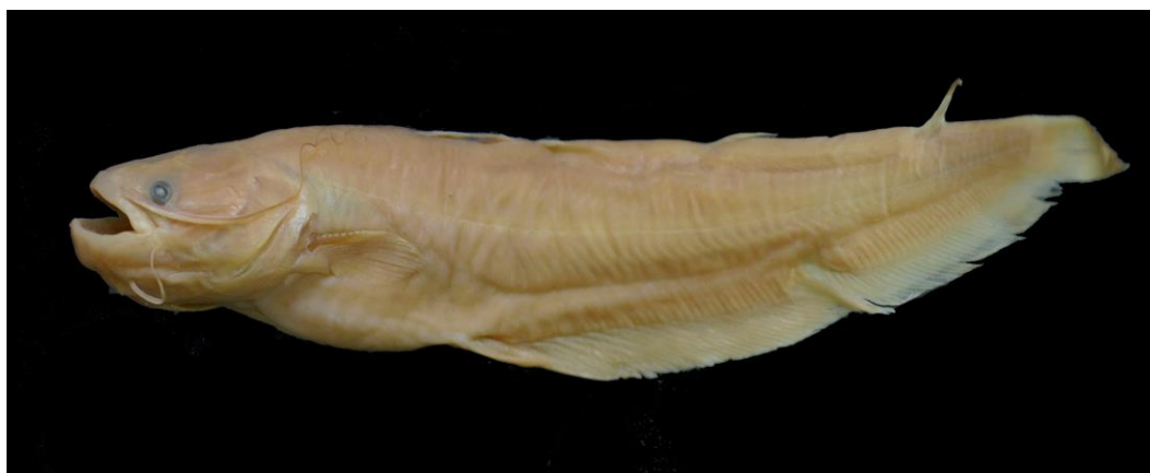
Figure 2: Lateral view of the variant of Silurus asotus .