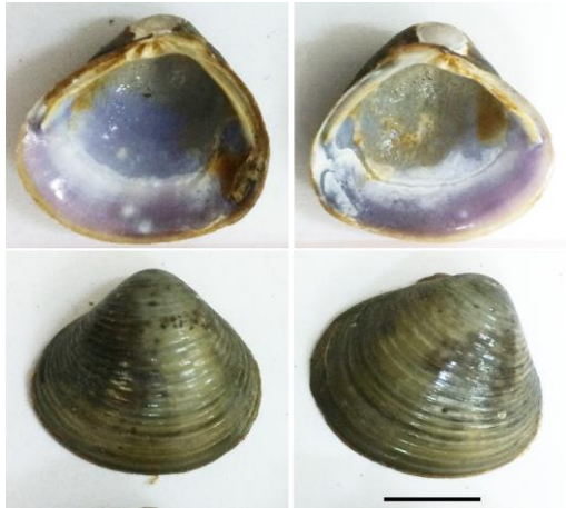
Figure 1: Photos of Corbicula fluminea . Scale bar: 1 mm.

Heavy metals in clam's tissues were extracted as previously reported by Yap et al. (2003) with minor modifications. Briefly, soft clams tissues were homogenized in 2 mL of concentrated nitric acid (75%). After sonication for 3 min, the samples were completely digested with 2 mL of the same solution for 12 h at 80°C. The digested samples were then centrifuged at 4000 rpm for 10 min under room temperature. The supernatant contained metals were kept at -20°C period to analysis.