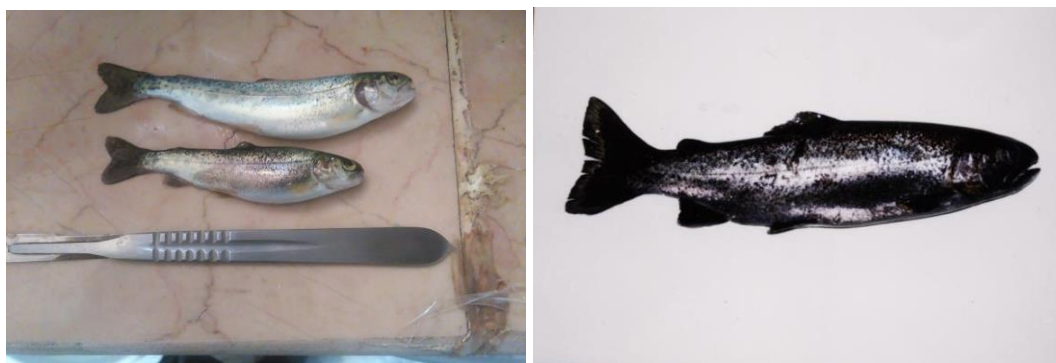
Figure 1: Clinical signs of infected fish.

Iran in 2018. Also, infected fish were collected with clinical symptoms such as darkening skin, external hemorrhages and internal bleeding in liver, kidney and skin or combination of these symptoms (Fig.1).