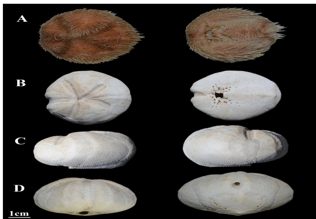
Figure 2: Metalia persica . A: Live specimen, B: Dorsal and ventral view, C: Lateral view, D: Frontal and distal view. Chabahar Bay, Iran.

fasciole. There are no anal fasciole. There are some enlarged tubercles along the frontal ambulacrum and frontal ambulacrum is rather sunken. Four genital pores are present. The shape of the peristome is semilunar and placed distinctly at anterior part of the test. Periproct is located posterior and enlarged upward (Fig. 2).