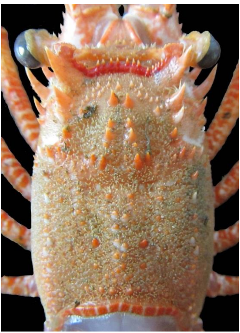
Figure 4: Dorsal view of carapace of P. waguensis from Oman.