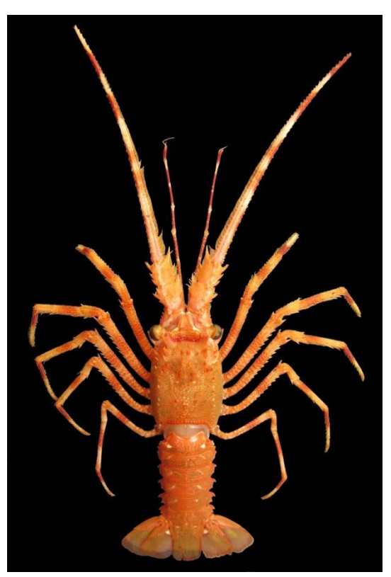
Figure 3: Palinustus waguensis, adult male, 43.1 mm CL, from the coastal waters of Oman.

Anterior margin of carapace between frontal horns bearing 5-7 spines (Fig. 4). Frontal horns truncated, with 5–7 distinct spines on inner margins. According to Holthuis (1991), the presence of several distinct spines on anterior margin of carapace as well as inner margin of the frontal horns are distinguished features of the species, while following Chan and Yu (1995) anterior margin of carapace between frontal horns provided with 0 to 8 spines and inner margin of supraorbital horn armed with 0-5 spines. Epistome armed with 3 to 5 spinules on the anteromedian margin. Antennal peduncle armed with many spines with one distinctly long spine on distal part. Carapace was heavily pubescent with rows of regular spines along lateral edges. Postorbital spine is shorter than