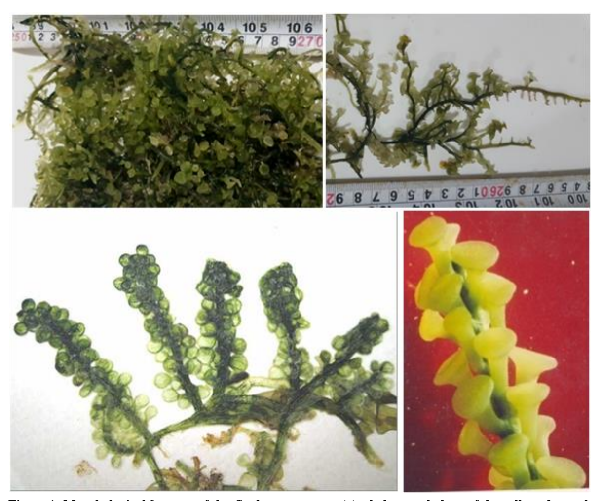
Figure 1: Morphological features of the Caulerpa racemosa (a) whole morphology of the collected samples, (b) a detailed image from erect frond shows a discoid distal end of ramuli, (c) a detailed image of erect branches shows ramuli on the herbarium sheet (as C. racemosa var. macrophya in Sohrabipour and Rabiei, 2007) and (d) a close up image from discoid ends of ramulis of the samples that morphologically already reported as C. peltata (Sohrabipour and Rabiei, 2007) and C. racemosa , var. peltata in Sohrabipour and Rabiei 1999).

and 151 were parsimony-informative characters.