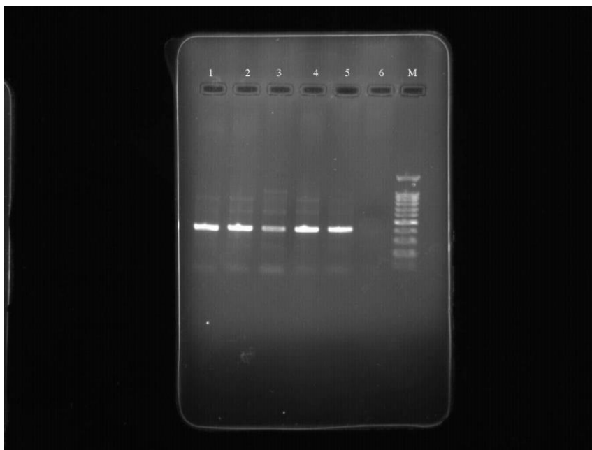
Figure 1: Gel electrophoresis of PCR product of Yersinia enterocolitica Column M: 100-bp DNA marker, columns 1, 2, 3, 4 and 5 of the positive samples studied, column 6 of the negative samples studied.