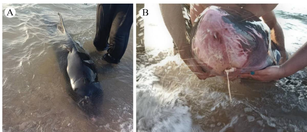
Figure 2: Dwarf sperm whale Kogia sima stranded in Larak Island, Persian Gulf, in 2023, A. dorsal view and the large, pointed dorsal fin, B. blunt squarish head with no major injuries. The foamy white matter oozing from the mouth is of unknown origin, but may be vomited squid remains.

The first stranding case occurred on 13 November 2023, at Larak Island (N 26°52'18", E 056°20'4"). The SL of the dwarf sperm whale measured 235 cm (Fig. 2). It was found alive by beach campers who intervened to facilitate its return to the sea. However, the individual was stranded again and succumbed shortly thereafter. A few biometric measurements were obtained (Table 1). The carcass was subsequently buried in the area close to where it was found and will be collected.